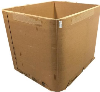
Reclaimed Double Wall Gaylord 47"L x 40.5"W x 40.5"H Double Wall - Octagonal