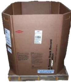
Used Quad Wall Gaylord 45"L x 37"W x 40"H Quad Wall - Octagonal