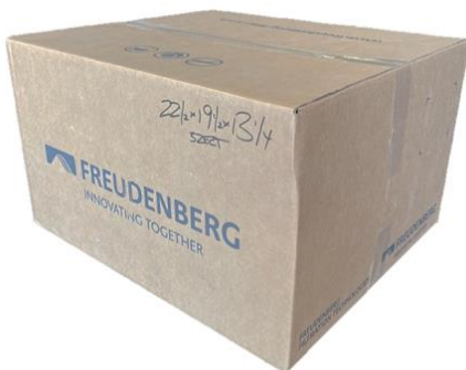
Recycled Printed Box - 44ECT 22.5"L x 19.5"W x 13.25"H 450 per skid $1.49 or less