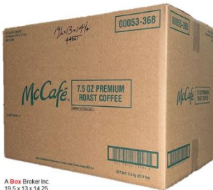
New Recycled Box - 44ECT 19.5"L x 13"W x 14.25"H 450 per skid