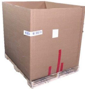
Triple and Double Wall Gaylord 47"L x 39"W x 43"H Squared Corners