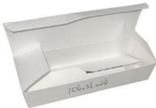
New Chip Board Box 10.25"L x 3.5"W x 2.25"H