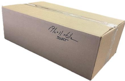
Recycled Plain Box - 32ECT 19.5"L x 11"W x 6.5"H 675 per skid