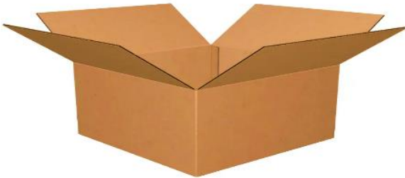
Recycled New Box - 44ECT 22.5"L x 15.5"W x 12.25"H