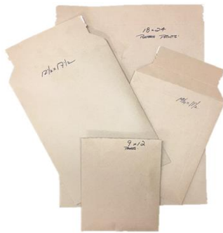
Kraft Paperboard Self Seal Mailers