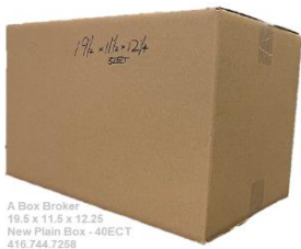
New Recycled Box - 40ECT 19.5"L x 11.5"W x 12.5"H 1000 per skid Call for Volume Discount! As low as $1.19

19.5 11.5 12.5 40 ECT New Plain 1.6 Specials